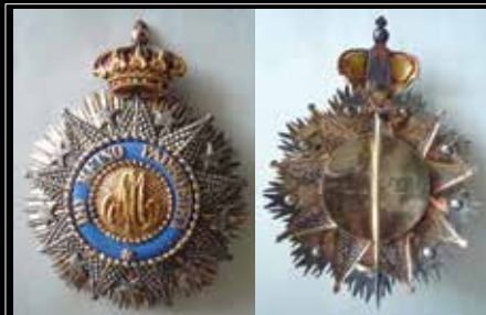
OCVV/GC17.1 - Placa de Grã-cruz, ou de Comendador

Prata dourada, centro e coroa de ouro. Dim.: Peso n.d.