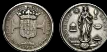
CO 1.07 – Leilão USB 84/2010, Genève, Suíça (peso 27,69 g)