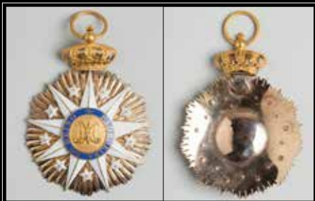
OCVV/GC3.1 - Insignia pessoal do Príncipe Carlos Maurício de Talleyrand, de 1834

Ouro com esmalte, peso n.d. Resplendor dia, 60 mm, altura com coroa e argola cancelada 90 mm. Centro marcelado em raios divergentes.