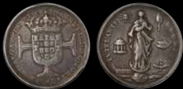
CO 1.05 – Fundação Millennium BCP, Porto (peso 25,14 g)